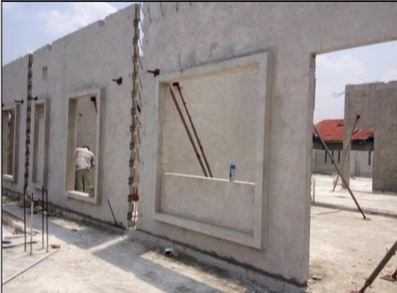
Load bearing wall