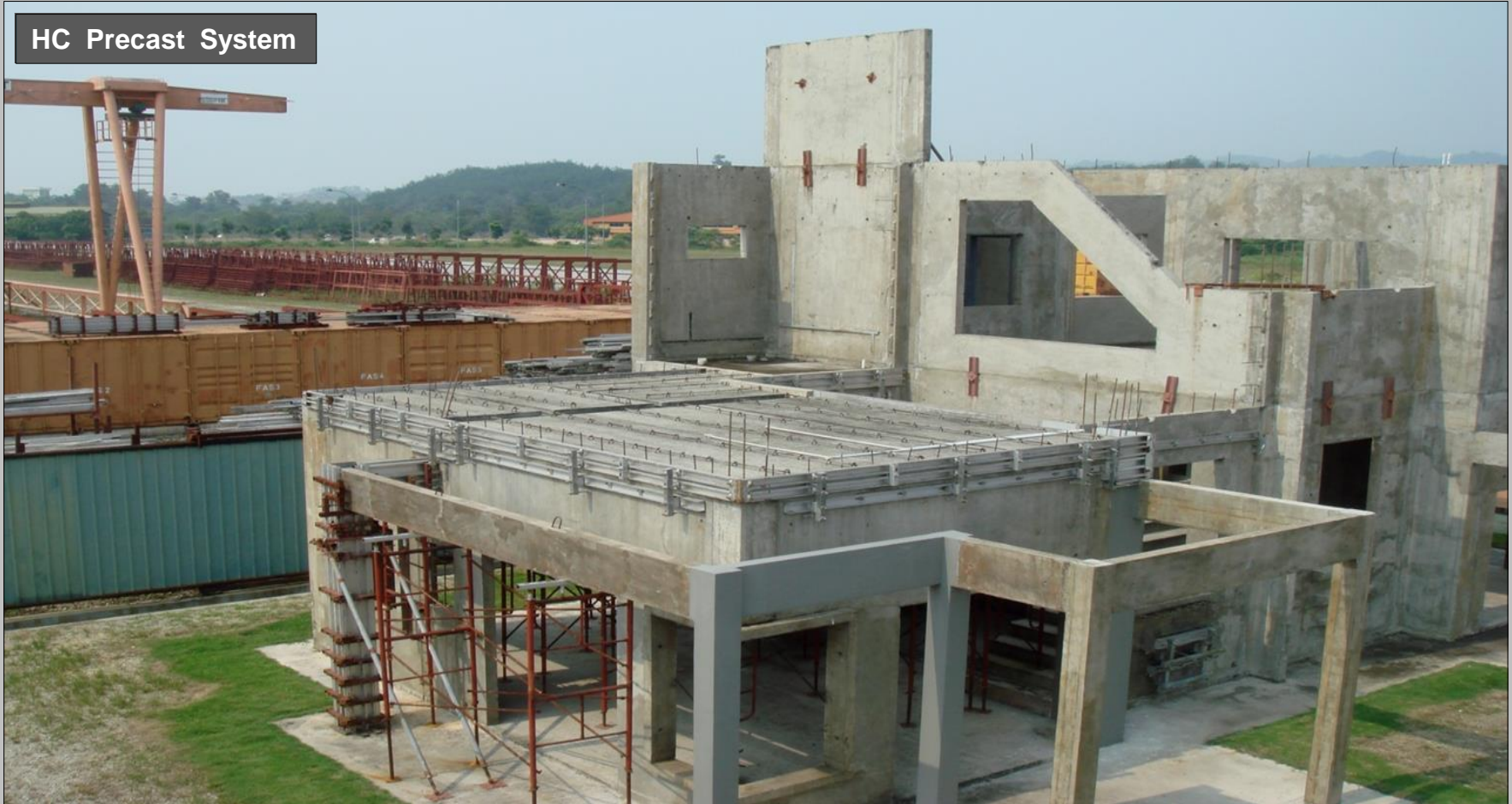
HC Precast System

Training unit : - 9 years expose precast wall, precast staircase, half slab & precast beam with in-situ column. - No Maintenance - No Touch-up - No Water proofing - No Leaking - No crack